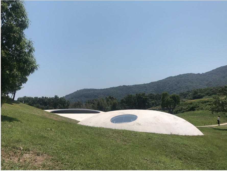
FIGURE 2. Teshima Art Museum exterior, photograph, August 5, 2018, Teshima.

This can ultimately bring all these museums together into critical contemporary conversation despite their differences as a collective form of recently established heritage on Naoshima and Teshima. Encoded within them is a shared global heritage of growing environmental consciousness through which ideologies towards ostensibly socially and materially sustainable futures and countercultures are questionably envisioned.