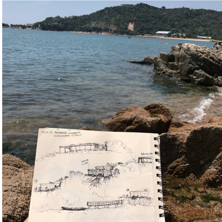
FIGURE 5. Sketch of Benesse House Museum and Oval in landscape, photograph, August 4, 2018, Naoshima.

These points reveal that the Benesse art site was bound to the overarching context of Japan's growing concern since the 1990s with assuring resources (Johnston 2009), such as the construction of art museums as a form of tangible cultural heritage. Equally, there was the need to develop intangible socio-economic resources to revitalise declining regions like Naoshima in the first place. Diversifying the resident community to make it more populous and sustainable, aimed to attract younger generations of creative class immigrants who might develop a creative culture of their own. Next, I turn to look at how this philosophy of wellbeing, which Benesse officially coined in 1995, might be similarly challenged by how it manifests through the architectural site and its infrastructure.