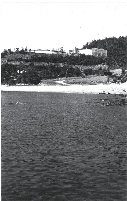
FIGURE 3. General view from the ocean (Furuyama 1996, 161).