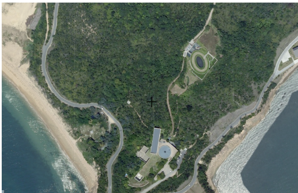
FIGURE 1. Google Earth, [Benesse House Museum and Oval], 2021, digital image, Google Earth, https://earth.google.com/web/search/Naoshima+Island,+Naoshima,+Kagawa,+Japan/@34.44576033,133.99229652,20.60510072a,763.57590547d,35y,0h,0t,0r/data=CigiJgokCdwm2q2LOUFAEVeN1_4cOUFAGYhmAEOSv2BAIYkoCDh3v2BA .